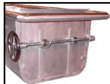
Controlled Flow End Gate