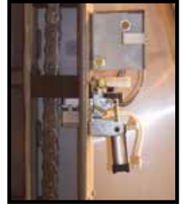
Safety Latch Engaged