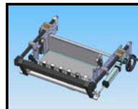
Divider Box and Ejector