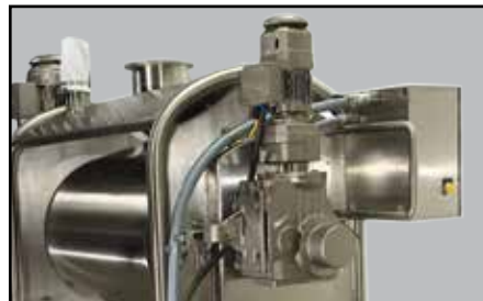
Simple Direct Drive Tilt Mechanism