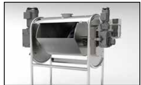
Optional Reverse Tilt System