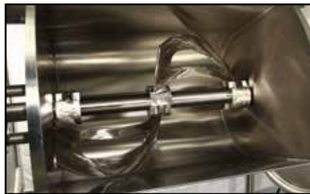
Stainless Steel Sigma Arm Mixer