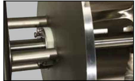
Sanitary Main Shaft Seal