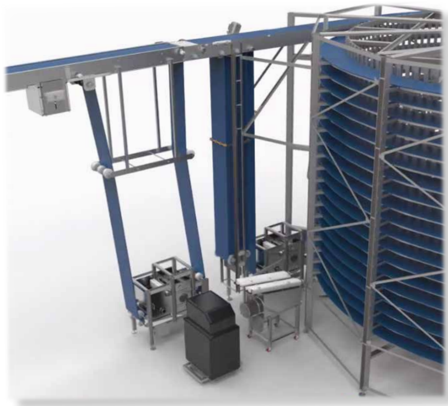
Dual Washer with Single Blower / Heater Unit.

Removable quick connect plugs for the blower, water heater and water pump units allows for efficient changeover to dual washer configuration.