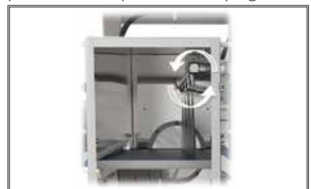
Water Rotary Header allows to clean the belt washer enclosure