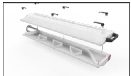
Energy efficient, detachable air knives for easy sanitation