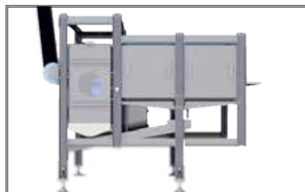
Extra drying option for (CIPIP) Clean in Place in Production