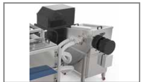
Optional water heater, water pump with enclosed ambient air blower provided with quick connect plug.