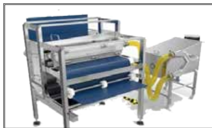
Small footprint design