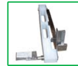
Swivel Mount For Pan Proximity Switch