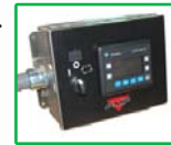
PanelView Operator Interface