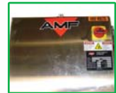
Stainless Steel Electrical Enclosure