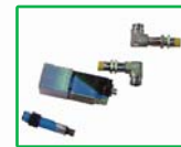
Pan, Proofer Prox(s) & Photoeye