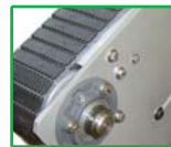
Intralox® Belt Drive