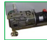
Servo Motor & SEW® Gearbox