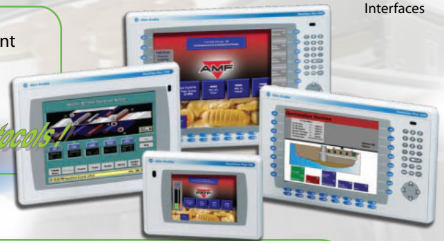
PanelView Plus Touchscreen Interfaces