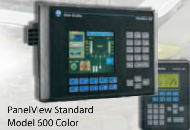
PanelView Standard Model 600 Color

To keep your plant running at optimum levels, you need readily accessible information, and a stable, reliable platform to allow operators to interface with that information in order to maximize productivity.