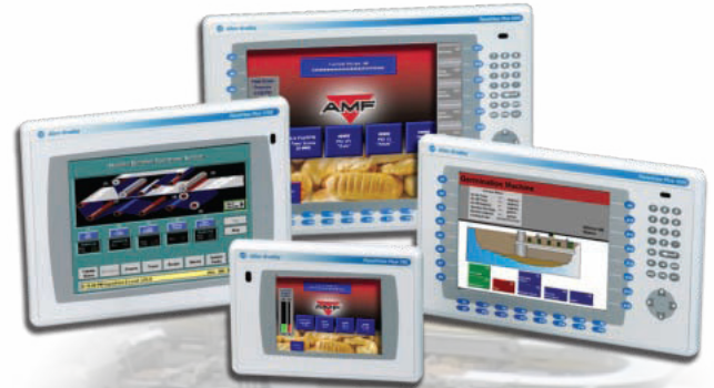
PanelView Plus Touchscreen Interfaces

To keep your plant running at optimum levels, you need readily accessible information, and a stable, reliable platform to allow operators to interface with that information in order to maximize productivity.