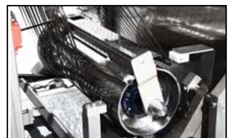
Cantilever Drum Design for Easy Blade Removal & Replacement