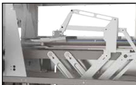
Pendulum Scoop Drive