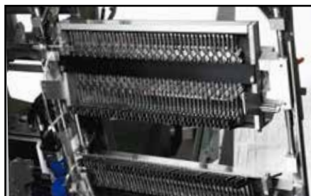
Heavy Duty Self Supporting Stainless Steel Lattice Pull-out Mechanism