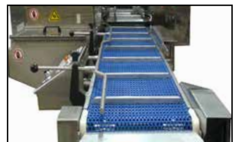
Flusher Action Discharge