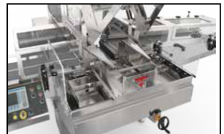
Automatic Dual Wicket Changer