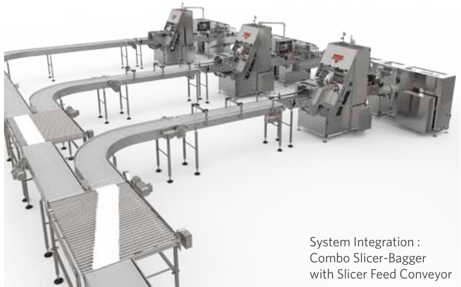
System Integration : Combo Slicer-Bagger with Slicer Feed Conveyor

The AMF bagger includes basic tunnel conveyor guarding as a standard for optimal operator safety. Blade break detection system and a high efficiency brake motor promptly stops the blades in emergency situations.