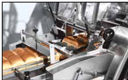
Optional Flight Pusher Infeed