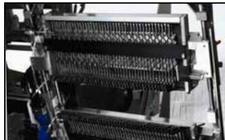
Heavy Duty Self Supporting Stainless Steel Lattice Pull-out Mechanism