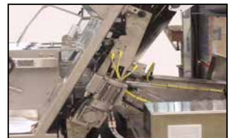
Automatic Slice Thickness Adjuster