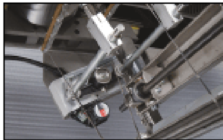
Automatic Hone Assembly