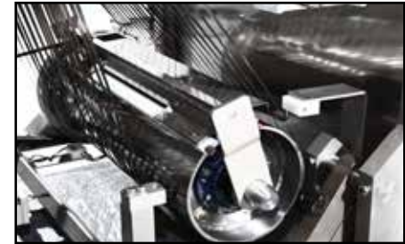
Cantilever Drum Design for Easy Blade Removal &amp; Replacement