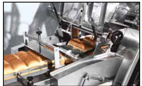
Flight Pusher Infeed Conveyor