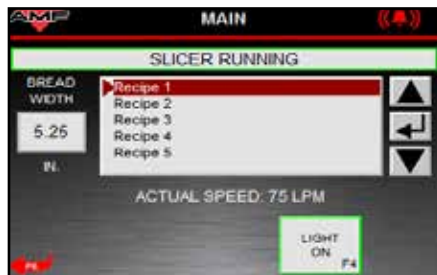
Operator Interface Screen