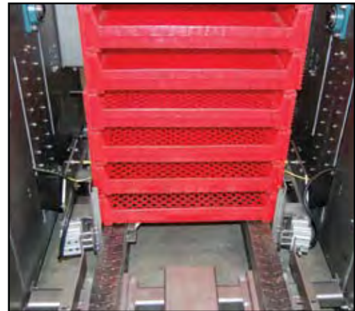
Basket Lifting Detail