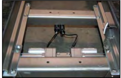
Optional Width Adjustment