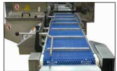
Flusher Action Discharge