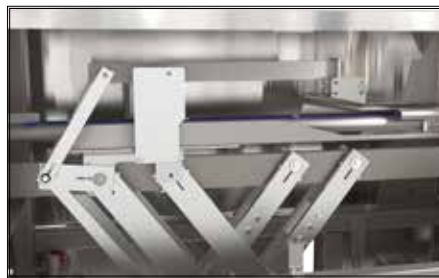
Pendulum Scoop Drive