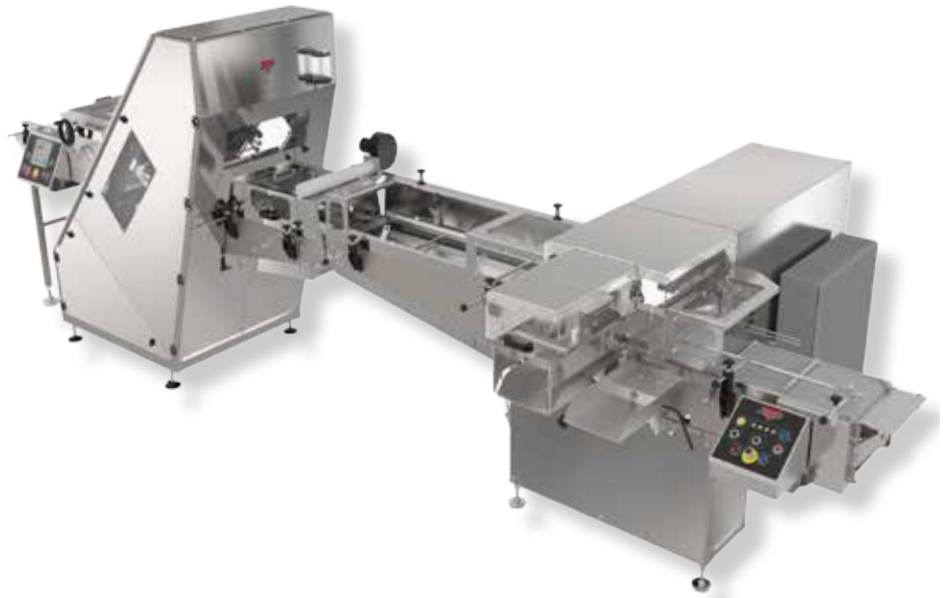
Mark 60 Bread Bagger shown with Saber 60 Band Slicer

Patented flusher discharge conveyor eliminates loaf disruption often caused by conventional flusher bars turning loaves over at higher speeds resulting in product quality issues.