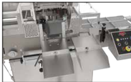
Optional Automatic Dual Wicket Changer