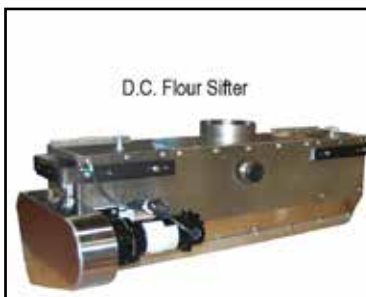
D.C. Flour Sifter