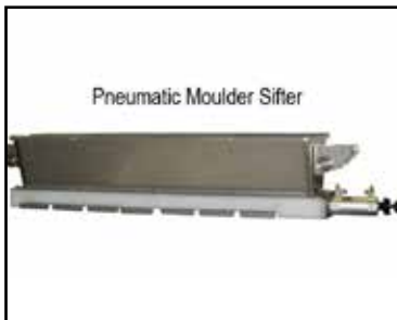
Pneumatic Moulder Sifter

Above are a few of the many AMF sifter variants available