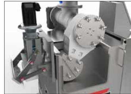
Vane Style Metering Pump