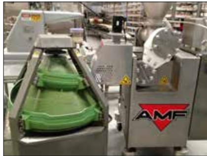
Sanitary "Uni-Body" SS Frame