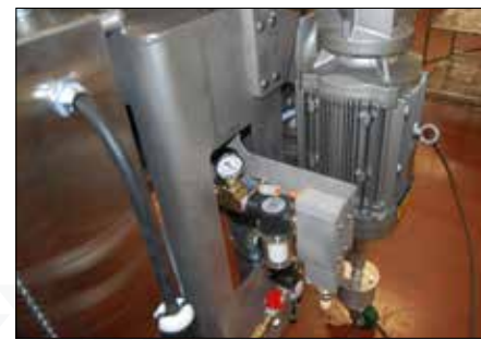
Slide out Access Panel to Access Vacuum Generator