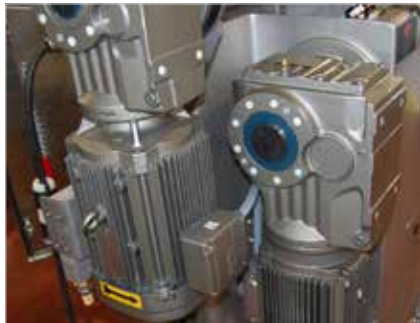
Direct Drive AC Sew Gearmotors