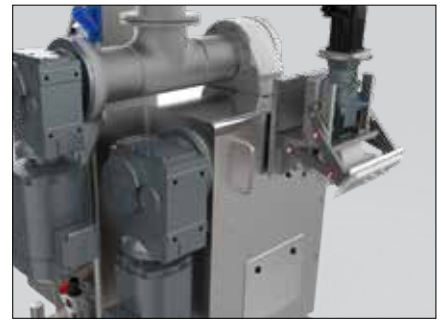
Servo Driven Cut-Off