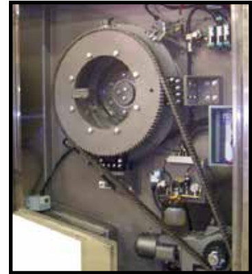
Mechanical Tilt Mechanism Side