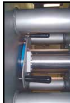
Sanitary Main Shaft Seal