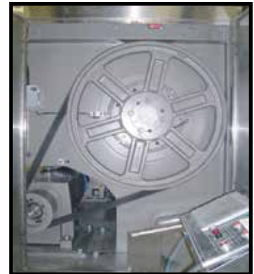
Agitator Drive Side