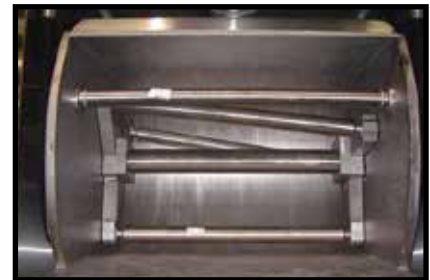
Optional Y-T Agitator