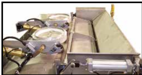
Mixer Top Canopy With Multiple Flour Inlets and Sponge Door