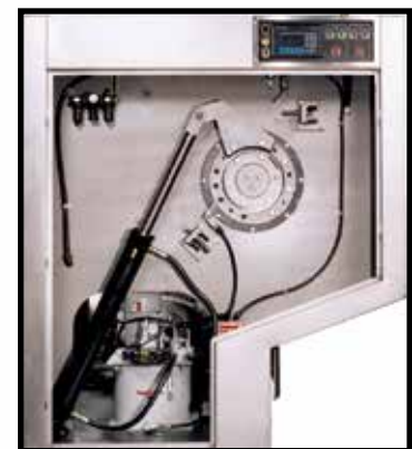
Hydraulic Tilt Mechanism Side With Special Operator Controls