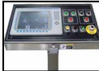
Optional Remote Pedestal Operator Console with Dough Quality Monitoring System