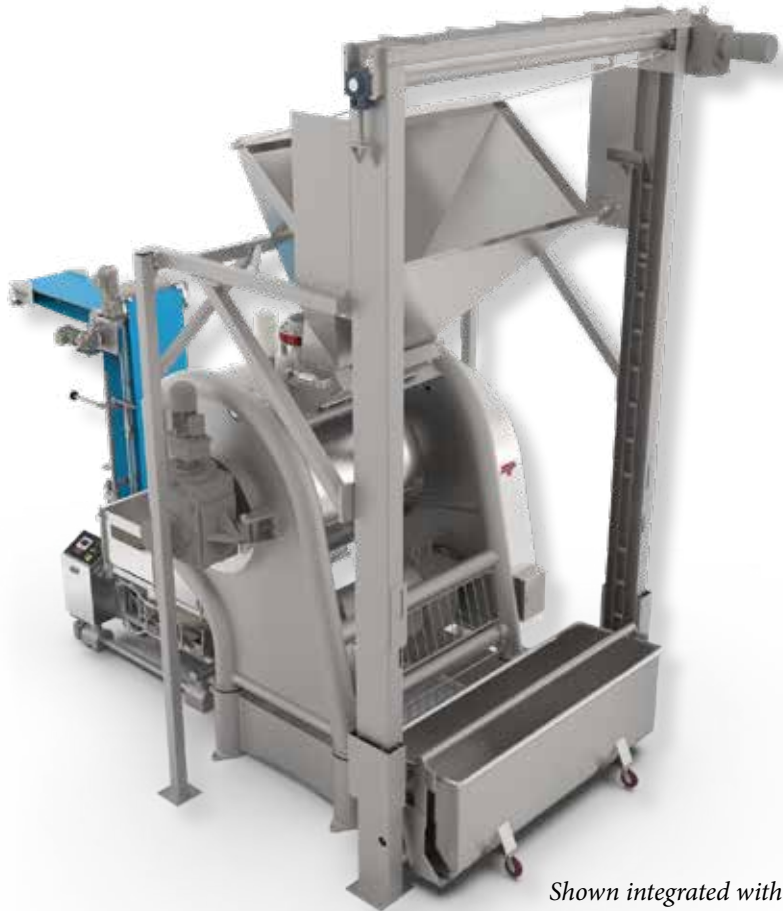
Shown integrated with Trough Hoist, Mixer and Dough Chucker.

High quality construction with radius corners, exterior welded seams, emery buffed and cleaned. Internally welded seams are ground flush and polished with continuous welds for easy sanitation.