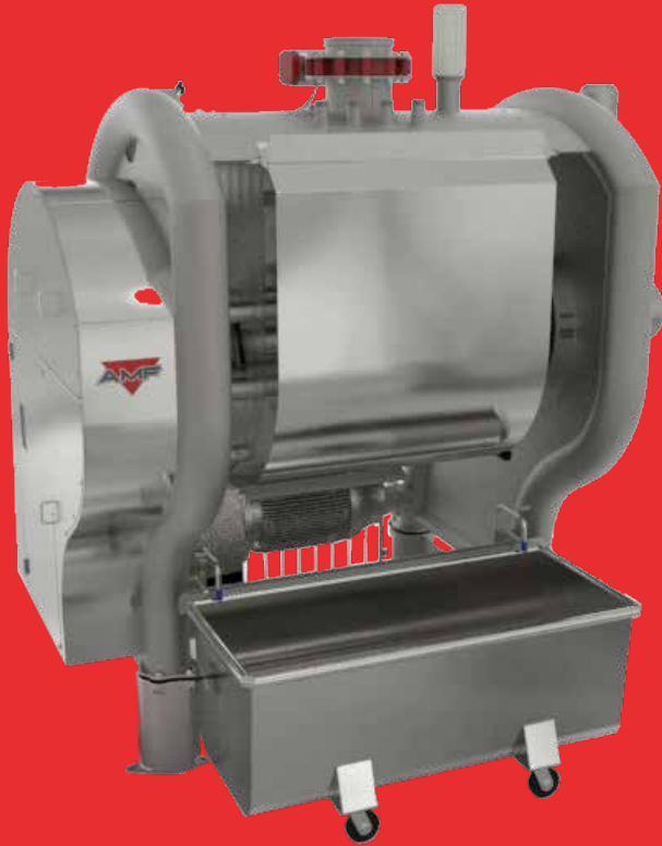
AMF Mixer Applications