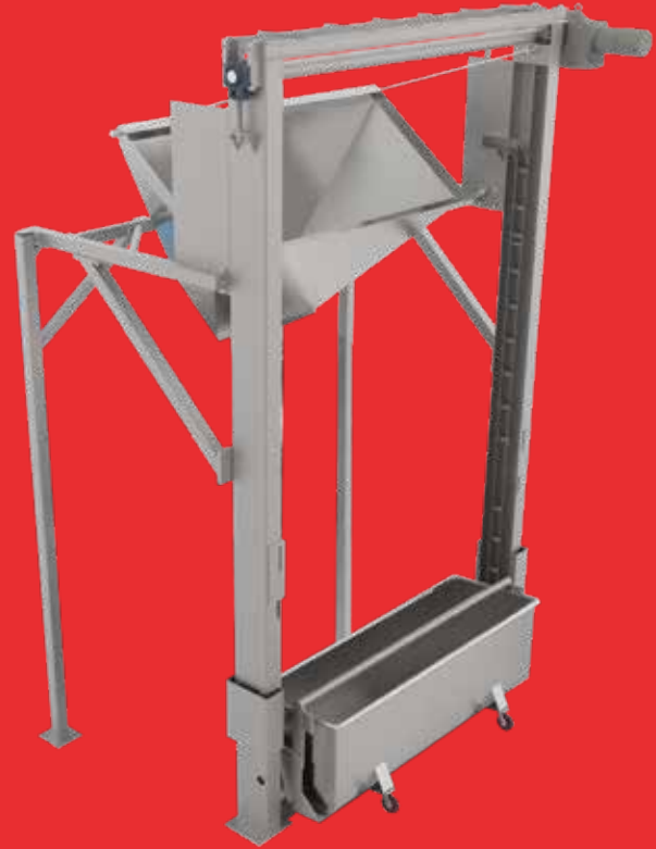
AMF Trough Hoist Applications