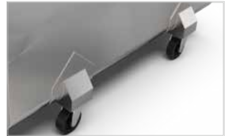
Sanitary Casters and Caster Shoes