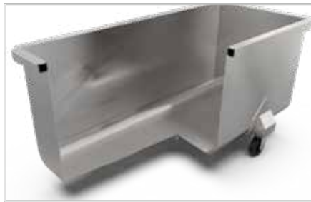
Designed With Quality Material For Optimal Dough Development