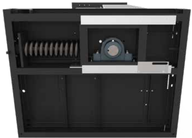
Original Configuration with Spring Tensioner