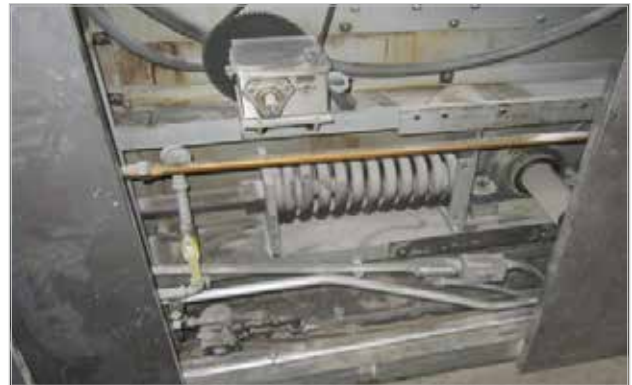
Original Configuration with Spring Tensioner